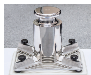
Positioners on an open-workweighing pan