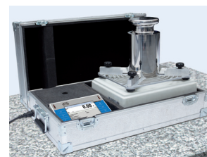
Specially designed suitcase for PM 4Y.KB mass comparator