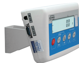
Possibility to mount the indicator to the wall