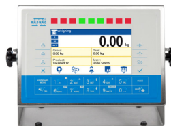
Bar graph is a graphic visualisation informing on current mass