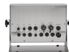
Easy access to communication interfaces