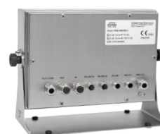
Intrinsically safe interfaces and hermetic connectors in stainless steel housing